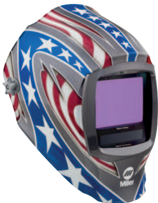
Stars and Stripes™ 280049

©2019 Caterpillar. CAT, CATERPILLAR, BUILT FOR IT and their design marks are registered trademarks of Caterpillar, Miller Electric Mfg. Co. is a licensee of Caterpillar Inc.