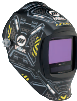
Black Ops™ 280047