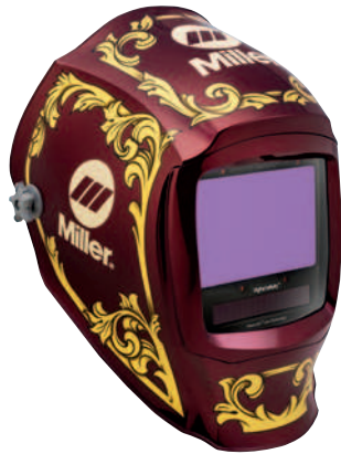
NEW! Imperial™ 280053