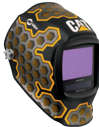
Cat® 2nd Edition 282007