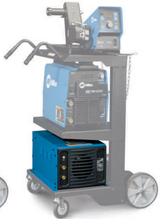
Coolmate 3.5 shown with XMT® 350 MIGRunner™