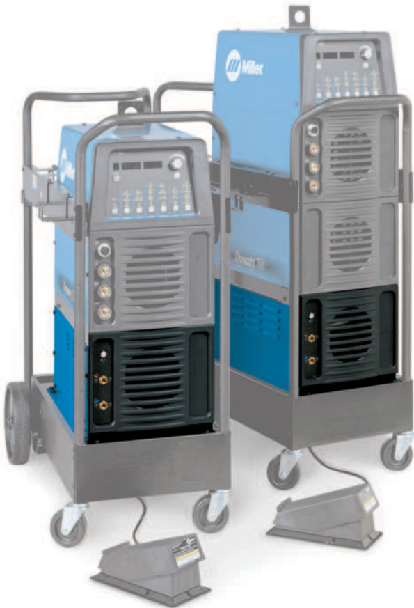
Coolmate 3.5 shown with Dynasty® 400 TIGRunner® and 700 TIGRunner®