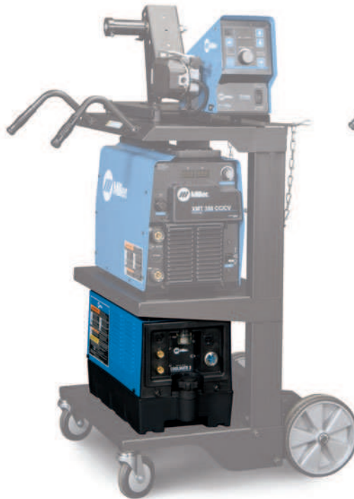
Coolmate 3 shown with XMT® 350 MIGRunner™