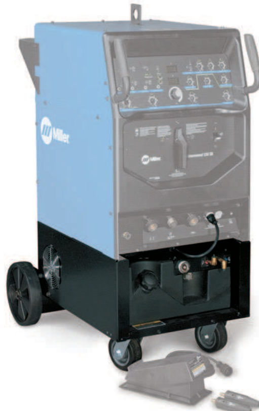
Coolmate 3X shown with Syncrowave® 250 DX TIGRunner®