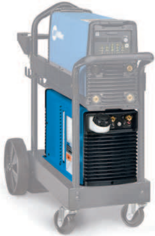
Coolmate 1.3 shown with Maxstar® 280 DX TIGRunner®