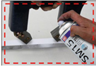
3. 자화전류 자장 형성