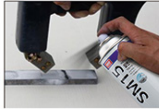
→ 4. SM-15(일반자분) 스프레이 도포