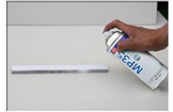
→ 2. MP-35(백색검사제) 스프레이 도포