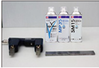
검사장비 및 자분탐상 스프레이