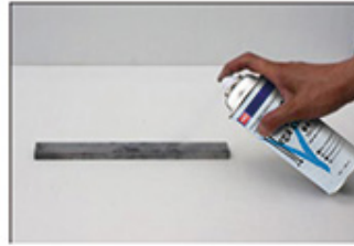
1. 검사물 세척