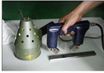
2. 자화전류 자장 형성