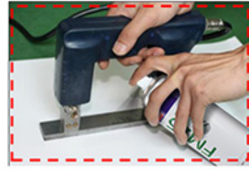
3. FM-25(형광자분) 스프레이 도포