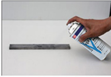
1. 검사물 세척