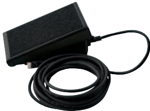
RFCS-RJ45 Remote Foot Control 300432

North/south rotary-motion fingertip current and contactor control attaches to TIG torch using two hook-and-loop fasteners. Great for applications that require a finer amperage control. Includes 13.25-foot (4 m) cord with plug.