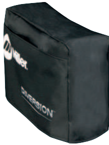
Protective Cover 300579

219259 For power cable 5-20P (120 V/20 A). Optional, not included with Diversion.