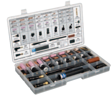
TIG Torch Accessory Kit AK-150MFC

TIG/Multitask Gloves 263352 Small 263353 Medium 263354 Large 263355 X-Large Goat grain leather with dual-padded palm and wool back.