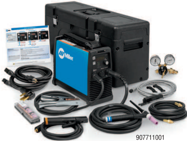
90771001 package shown.

STL TIG/Stick Package 907710001 STL TIG/Stick Package with Remote Fingertip Control 907710002 STH TIG/Stick Package with Remote Fingertip Control 907711001