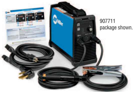
907711 package shown.

STL Standard Package 907710 STH Standard Package 907711