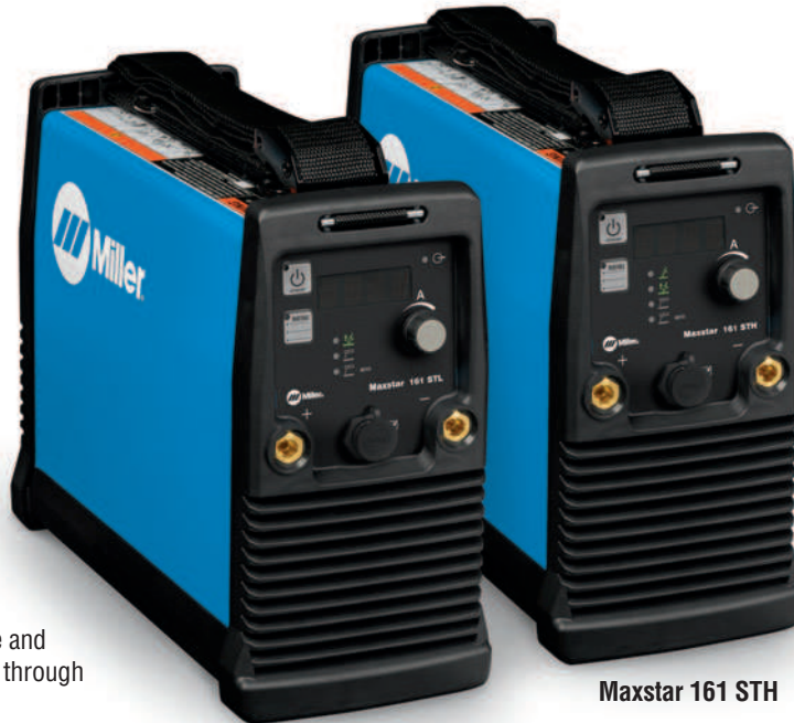
Maxstar 161 STL

Built-in gas solenoid eliminates the need for a bulky torch with a gas valve.