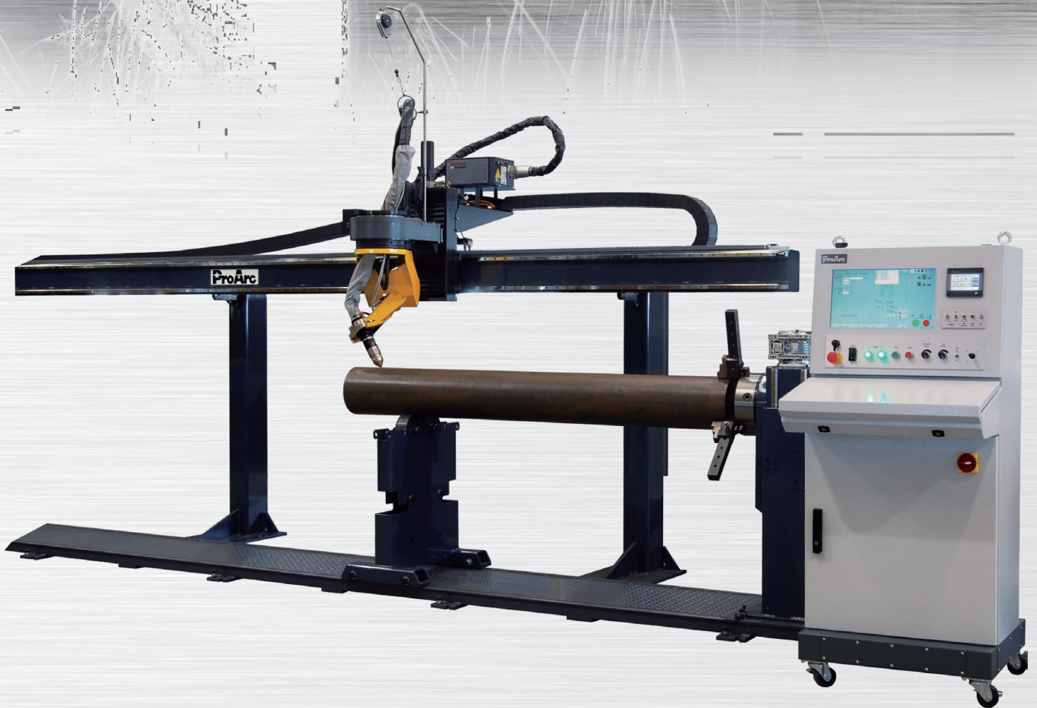
CNC Cutting Machine