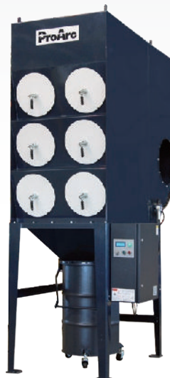
• ProArc Dust collector