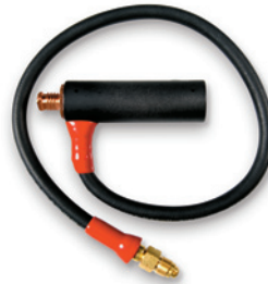
225028 50 mm thread-lock-style for water-cooled torch.