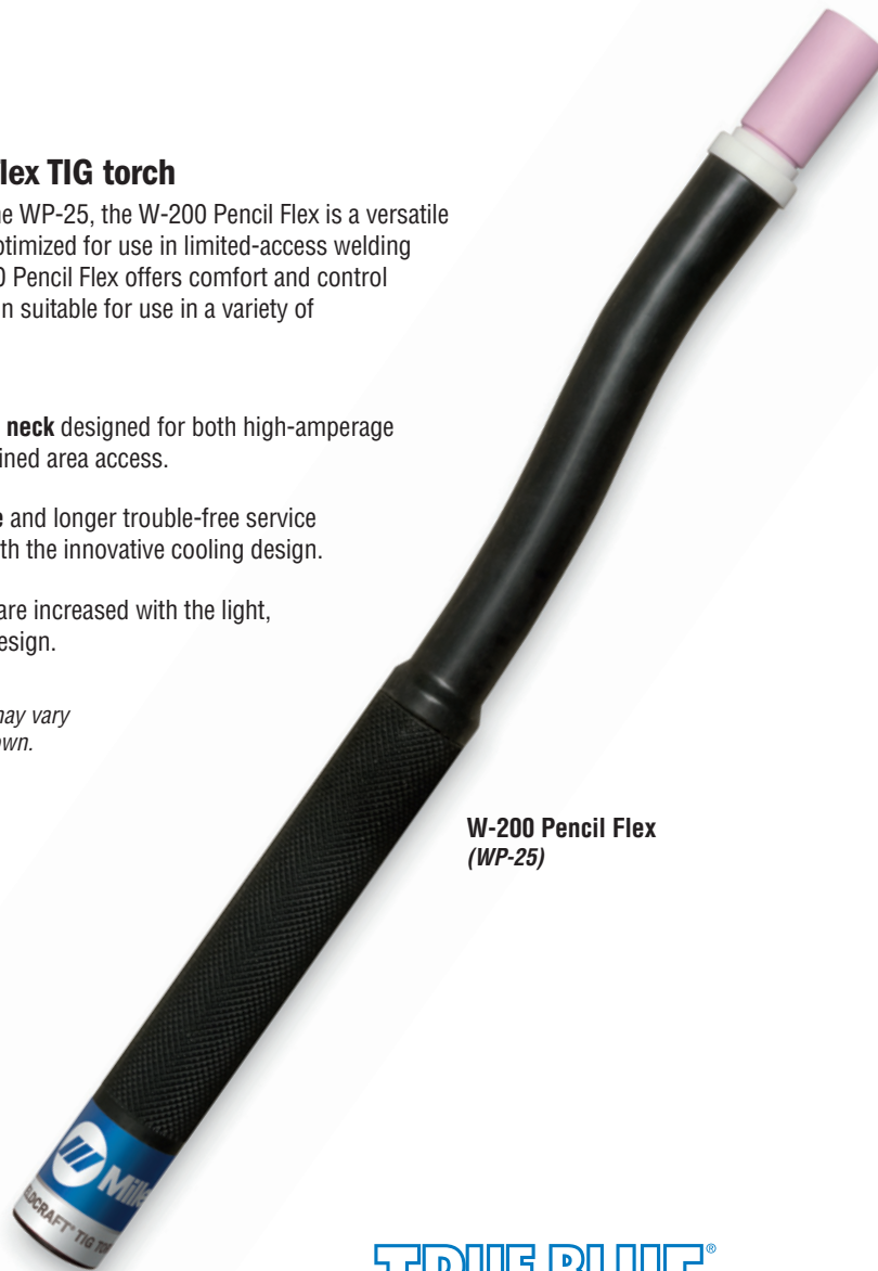
W-200 Pencil Flex (WP-25)

Note: Torch delivered may vary slightly from image shown.