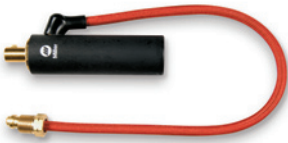
195377 50 mm Dinse-style with water return line for water-cooled torch.