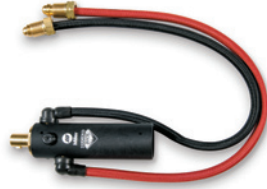
195380 50 mm Dinse-style gas thru with gas and water return lines for water-cooled torch.